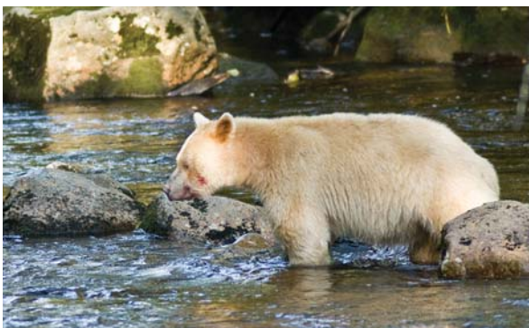
The incredible Spirit bear or Kermode fishing for salmon.

elusive all-white Spirit bear. With good luck, we will see all three colours of bears. August 27-Sept. 3 is now open for booking. If you are particularly longing to see a Spirit Bear, book the September 17-24 trip as we spend two days at the native viewing stands.