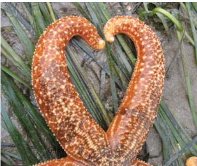
The beautiful shape of a seastar exposed at low tide. We never know what we'll discover.

We are thrilled to have another full schedule of trips to the Gwaii Haanas National Park Reserve in the Queen Charlotte Islands this summer. National Geographic described this as a "Trip of A Lifetime". Join us July 4-11 when the weather is warming, and before visitation