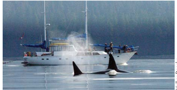
Having time for contemplation is one of the joys.