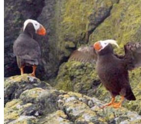
Colourful, Tufted Puffins up close in the Queen Charlotte Islands.