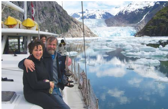
One of our amazing experiences! Floating before an Alaskan glacier, with time to enjoy all the ice up close.

The ancient totem poles at the UN World Heritage site of SGang Gwaay - Queen Charlotte Islands.