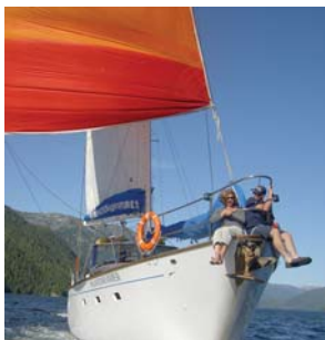
Gliding along under sail and colourful spinnaker on a lazy summer afternoon.

Spring and Fall are THE times to see bears along the British Columbia coast . After the first rains of the Fall, salmon start returning up the streams to spawn, congregating bears to feed. This is an essential part of the coastal bear's life cycle, and one they depend on to survive a winters hibernation. We expect to have excellent grizzly bear viewing in the larger estuaries, and join a native guide for a full day search for the