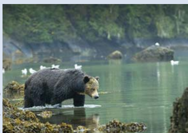
A female grizzly waits for salmon at the estuary mouth.

September is the end of the northern summer. While the days are starting to get shorter, the weather is often wonderful. Why choose this month to travel? Easy. Along the British Columbia coast it coincides