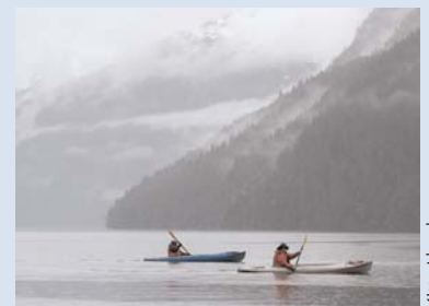
A quiet, misty morning kayak in the Great Bear Rainforest.

incredible to watch 8 bears waiting for salmon to literally swim by their feet. Eagles, ravens, gulls all congregate from miles around. A symphony of life!