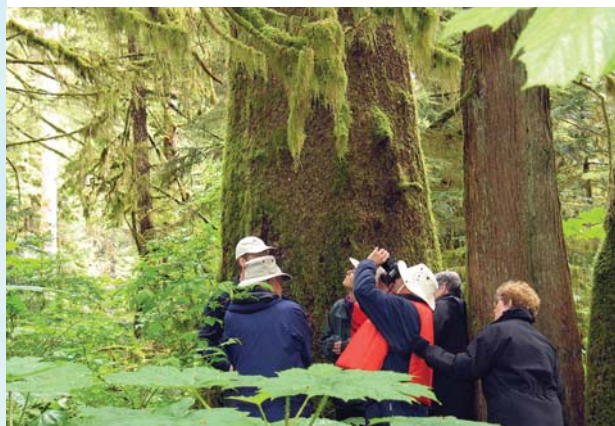
Immersed in the green cathedral-like coastal rainforest.

Full Disclosure – Can you believe the British Columbia government allows trophy hunting in all the new Parks and Conservancies announced to save the Great Bear Rainforest? The same holds true in Alaska. Help Bluewater stop the trophy hunting of bears – see PacificWild.org !