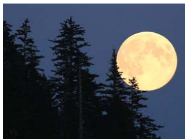
A night at anchor so quiet and peaceful, you can photograph the moon.