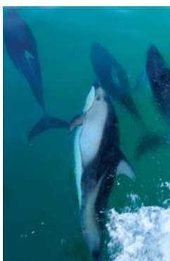
Pacific white-sided dolphins captivate as they play under the bow.