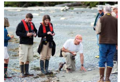
Explore wild westcoast Haida Gwaii beaches.