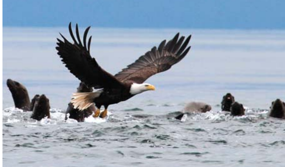
A majestic bald eagle swoops down into a curious group of juvenile Steller sea lions in Southeast Alaska.