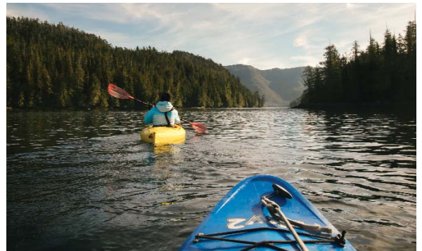
A perfect way to start the day: the peace and quiet of a morning kayak around a beautiful bay

After 30 seasons in Haida Gwaii we know the area as few do. National Geographic named our Haida Gwaii tour "One of 50 of the Worlds Best Tours".