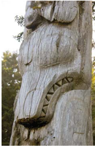
A killer whale crest on a mortuary totem at SGang Gwaay

There are few roads on Haida Gwaii and none in the Gwaii Haanas National Park Reserve. So it is only by kayak or yacht that one can access this incredible Island wilderness. The vast majority of visitors go with licensed guides, like Bluewater Adventures – for safety and local knowledge. With only 2000 visitors a year to the Gwaii Haanas National Park