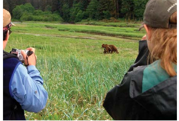
Bears are more comfortable with predictable human behaviour, staying in a group (Pack Creek, Alaska)

This gives them the choice whether to move on, or if they are comfortable to stay. Then upon seeing an animal, the first thing the guide does is assess the situation to determine how comfortable is the