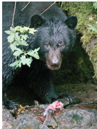
A black bear feasting on pink salmon (Anan Creek, Alaska)

The first thing to do in bear country is to ensure there are no surprises. While it may seem strange when looking for wildlife to make noise announcing our arrival, instead of slipping silently through the forest, it is important to let bears know we are there.