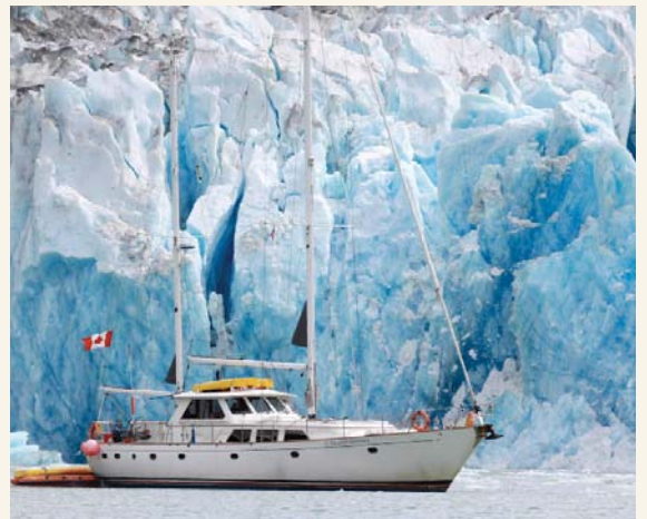
Island Odyssey dwarfed before the Dawes Glacier, Alaska