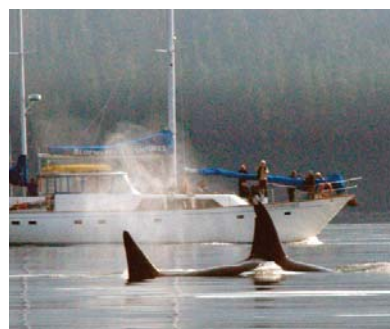
An intimate experience with a group of traveling transient orcas

Travel local also refers to a style of travel. It is about being off the beaten path, away from the main tourism routes and attractions – somewhere where the locals travel! The number one market for Bluewater Adventures is Canada... Canadians who know you