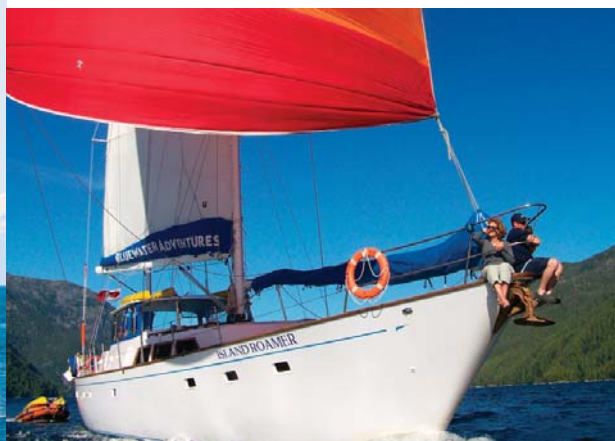
Island Roamer under sail amidst the beauty and calm of the "Inside Passage"

"The sea, once it casts its spell, holds one in its net of wonder forever"