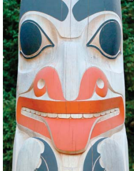
The new Haida totem pole at Windy Bay is the first raised in 130 years