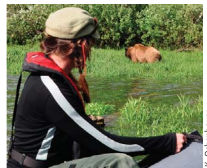
Floating silently while a grizzly feeds on sedges

and brings a wealth of knowledge including seminal studies of bears and wolves of the British Columbia coast. Learn about the interface