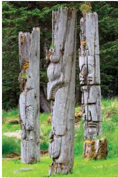
Ancient totem poles still stand in remote, old Haida villages