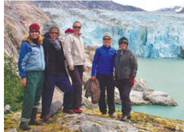
It is wonderful to get ashore to hike above the Dawe's glacier