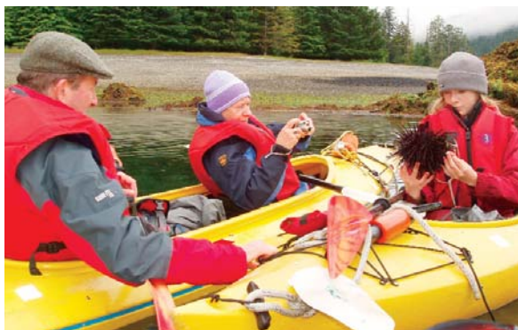
Exploring by kayak brings an added dimension to the trip.

Look for more special trips in future e-newsletters and the spring newsletter.