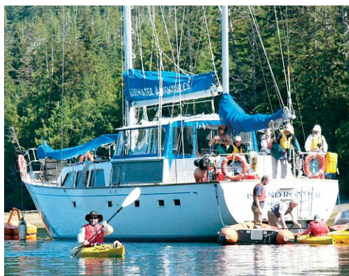
Our Gwaii Haanas – Queen Charlotte Islands cruise is listed in National Geographic's "Tours of a Lifetime"

In the October issue of National Geographic Traveler magazine, Bluewater Adventures' Gwaii Haanas – Queen Charlotte Islands cruise was selected as one of "50 of the Worlds Best Trips". We are honoured and excited to be listed in their 2nd Annual Tours of a Lifetime, beside such exotic travels as Snorkeling Burma, Living Among the Maasai and Mysteries of Ancient