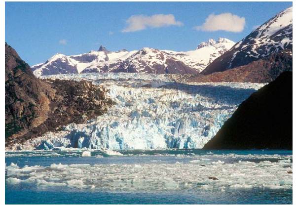
A majestic glacier flows into the sea below the Coastal Mountains. What a sight!