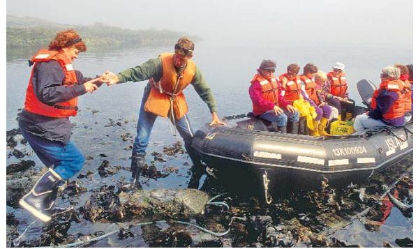
Zodiacs are used to transfer guests to and from shore.

Bluewater Adventures Ltd. #3 – 252 E. First Street North Vancouver, BC V7L 1B3 Tel: (604) 980-3800 Toll Free: 1-888-877-1770 Fax: (604) 980-1800 Email: explore@bluewateradventures.ca www.bluewateradventures.ca