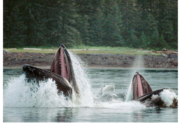
Humpback whales bubble-net feeding in Alaska.