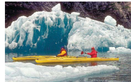
Getting up close to the ice in our kayaks and zodiacs