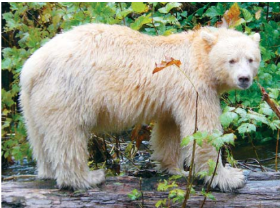
Seeing a Spirit Bear is an amazing experience.

In June we enjoyed some wonderful grizzly bear viewing as the bears 'mowed' and munched through the estuary plants after a long winters hibernation. Orcas were frequently sighted and the long days allowed us to explore some 'off the beaten path' places. In September, every one of our trips had great encounters