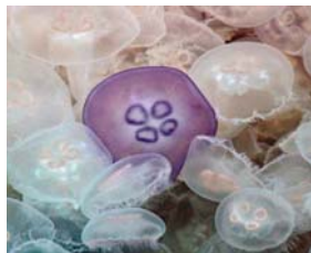
A “smack” of thousands of moon jellyfish, Gwaii Haanas