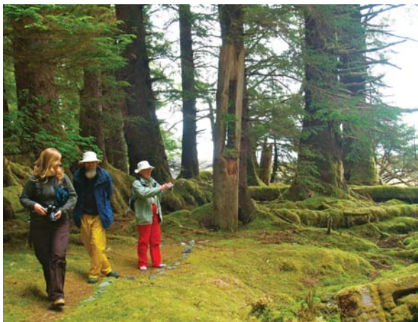
The forest is reclaiming the old Haida village of T’annu

Of course, the northern wildlife is different – bears instead of tortoises, eagles instead of boobies. The amazing history and art of the Haida is a tremendous cultural addition to the Canadian Galapagos experience.