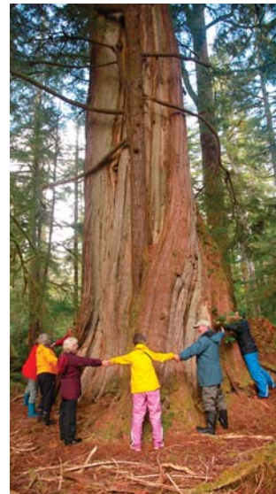
A giant Western red cedar – the Haida “tree of life”