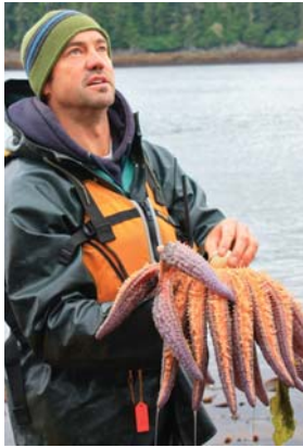
The naturalist explains the details of a sunflower star

Our 2012 schedule of trips outlines various destinations and the best times of year to visit each area. We already know of 3 particularly special offerings: