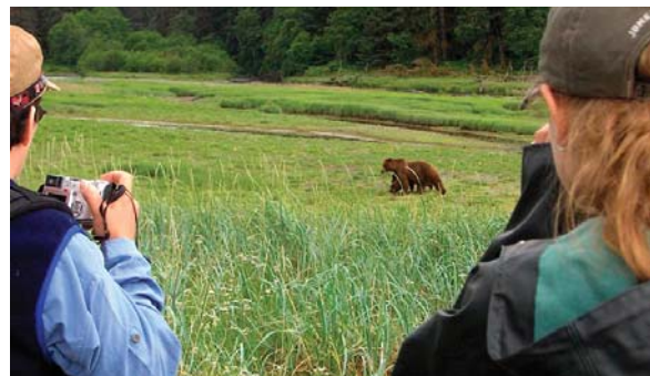
Pack Creek is considered the best brown bear viewing site in Southeast Alaska. We are excited to be adding it to our 2012 itineraries.

See Special Trips on our website for more information .