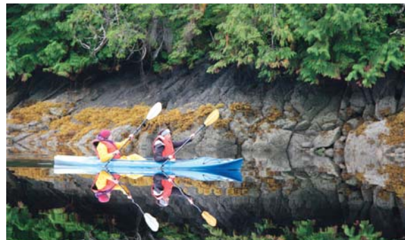
Guests intimately experience the shoreline and the mirror calm waters of the Great Bear Rainforest

Bluewater Adventures has been selected by the Canadian Tourism Commission to be part of the "Signature Experience Collection". Our Great Bear Rainforest voyages are one of the original 50 experiences selected from across Canada, representing the best Canada has to offer the world. We appreciate the recognition of the 'Bluewater experience' and this special area, with its incredible wildlife.