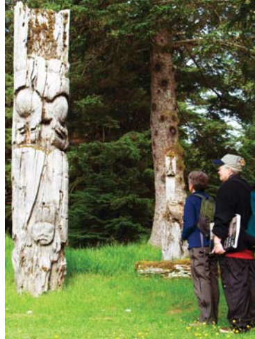
Discovering the ancient totem poles at the UNESCO World Heritage Site of SGang Gwaay

For more information on these specific trips or any other Special Trips, see “Special Trips” on our website .