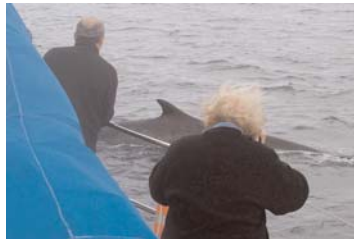
A “friendly” fin whale off the bow