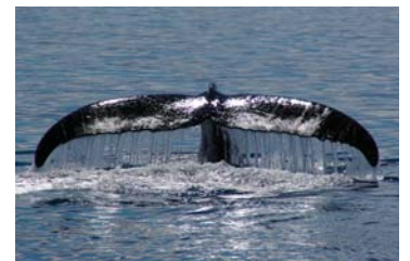
15’ tail flukes on a humpback whale

There is no taking for granted the incredible memories that we take away from our trips... They are what keeps us coming back for more.